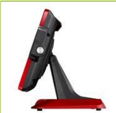
Small footprint and compact design