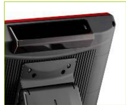
Optional VFD, MSR, iButton, Fingerprint reader and second display