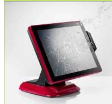
IP64 dust & spill resistant for front bezel