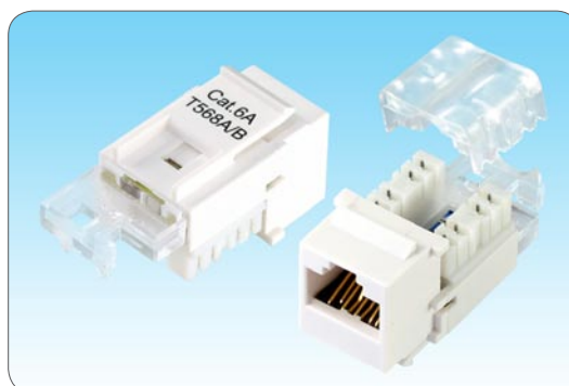
TA896AUC-2XX (with cable holder)