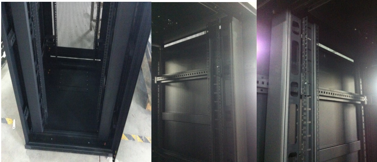
*with 4xcooling fan in the top