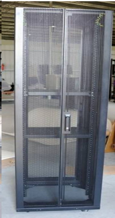
*Rear dual open perforated door