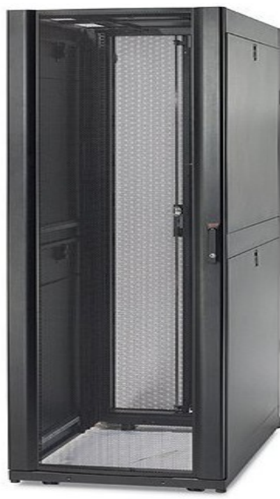
*2x section side door