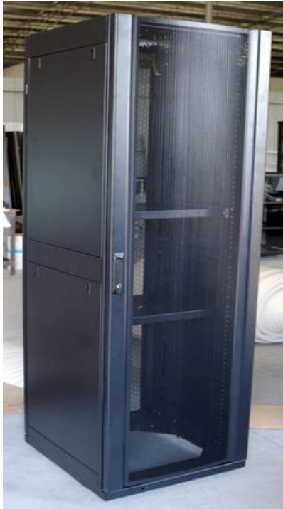
*Front perforated door