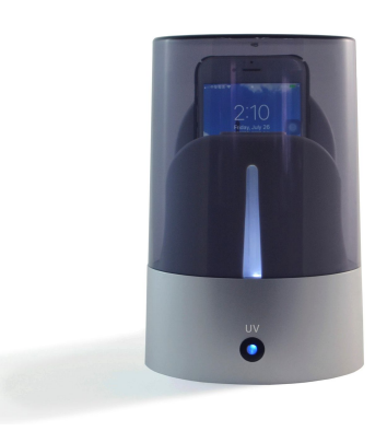
Cell phone not included

You might be surprised to learn that our phones are 10x dirtier than the average toilet seat.