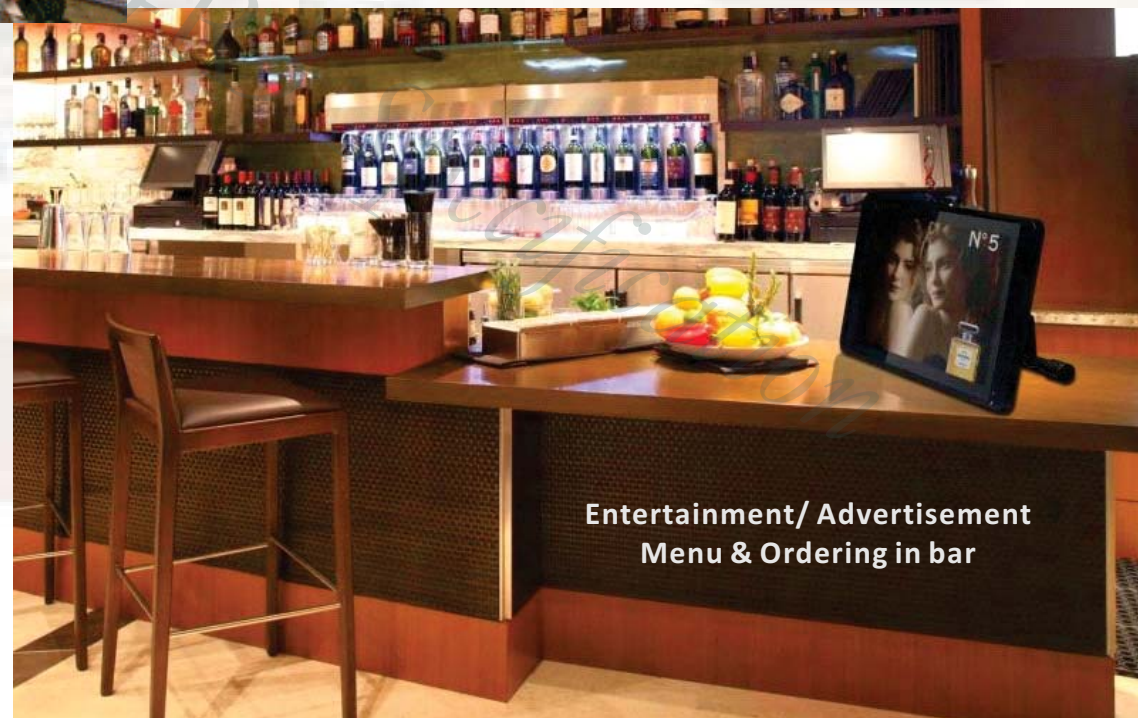
Entertainment/ Advertisement Menu & Ordering in bar