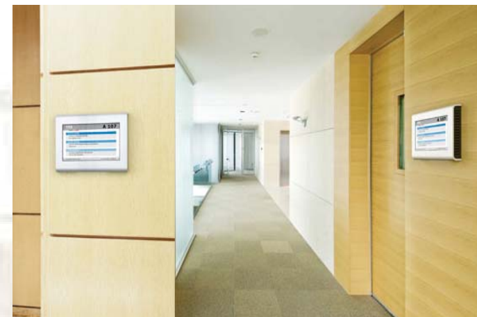
Digital Signage in Conf room