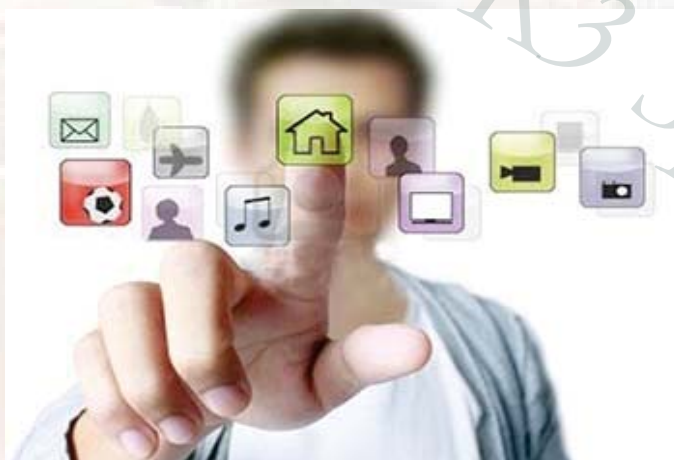
Touch & Control your Digital Life