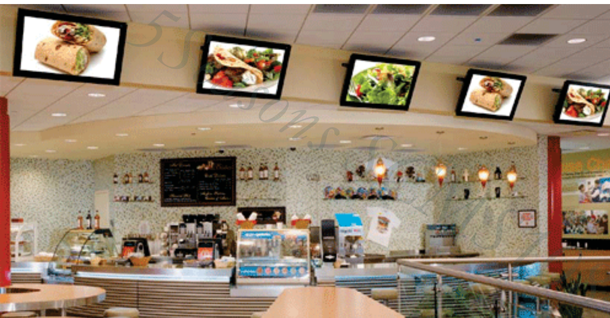
Preview menu in restaurant