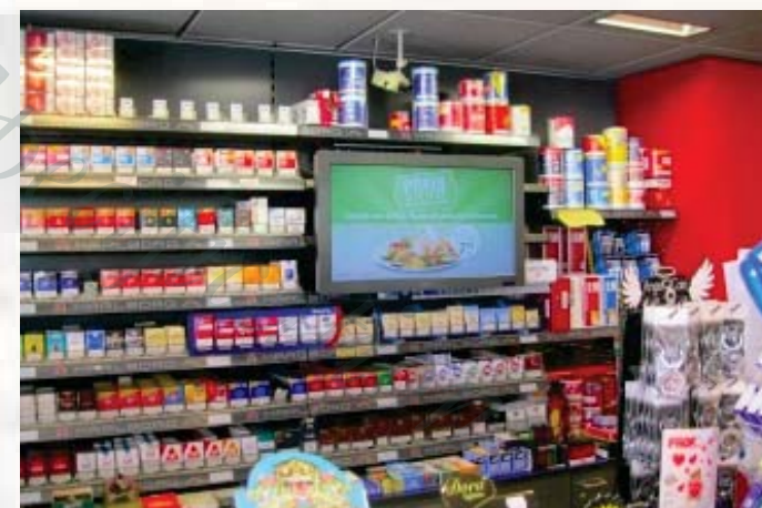
Retailed-Store Digital Signage