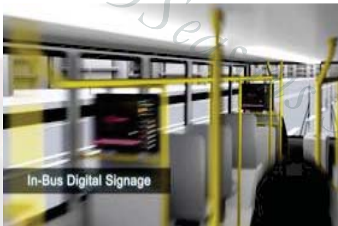
In bus/train Digital Signage