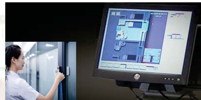
Building Automation & Security