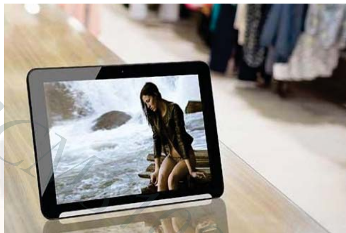
In-Store marketing in fashion store