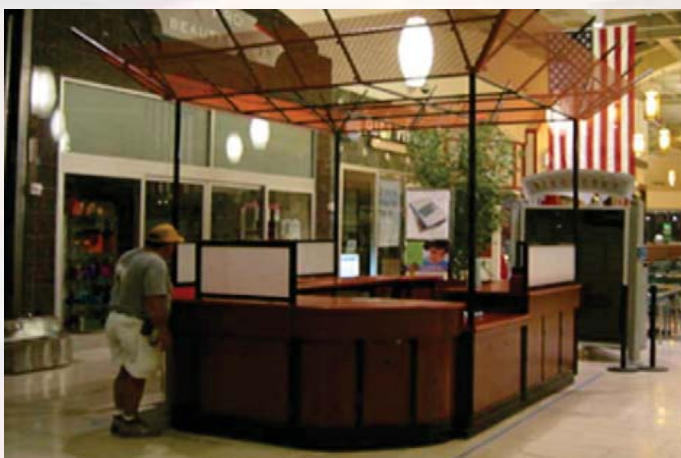
Electronic Kiosk in Information Station