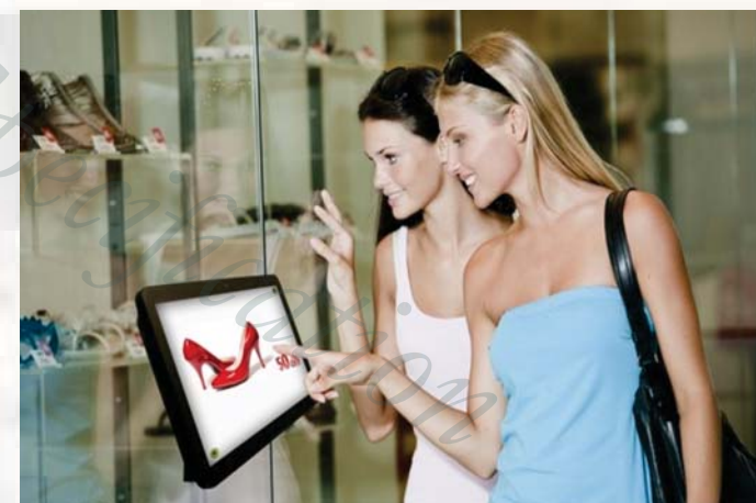
In-Store marketing at touch display