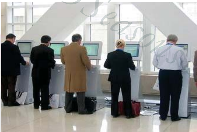
Exhibition Registration/ Internet kiosk