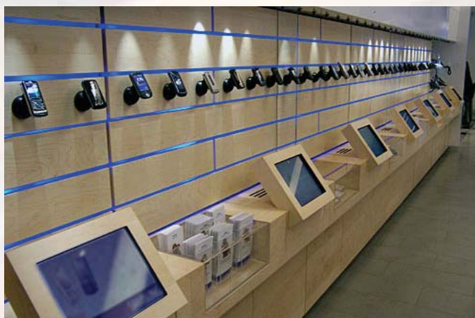
In-Store Digital Signage for product information