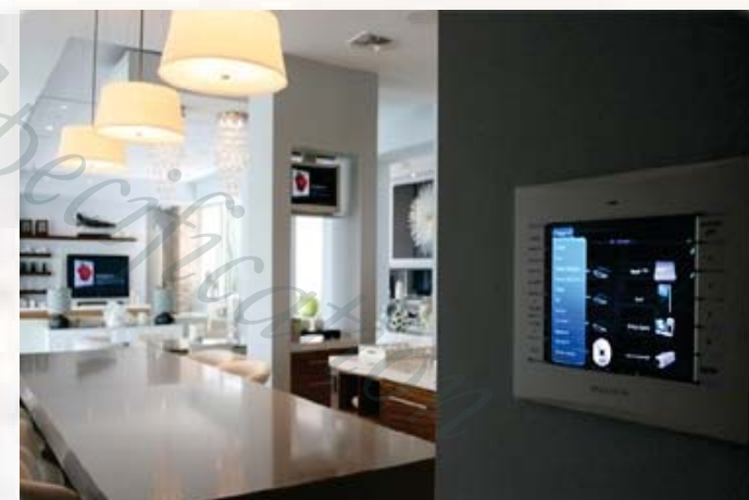
Smart Home & Surveillance