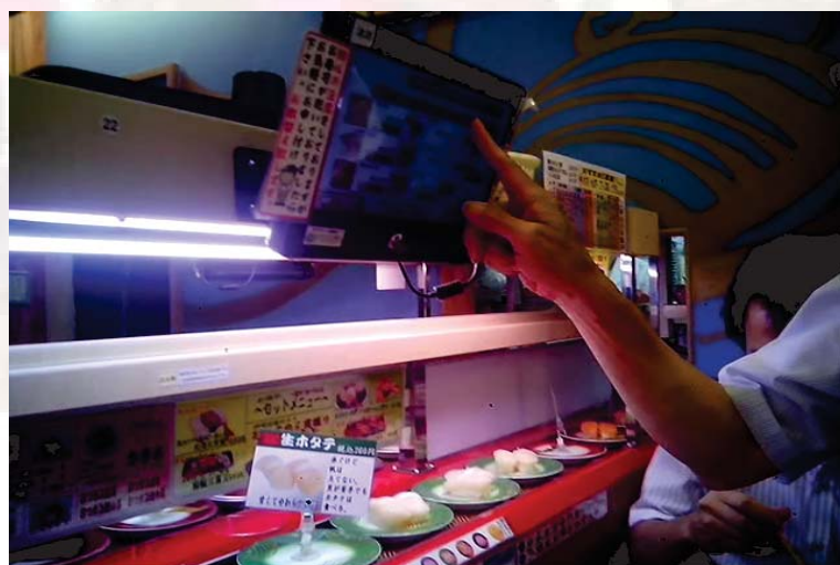
Self-ordering in restaurant