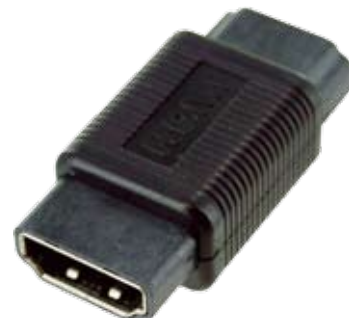
Embedded Cable Booster

BAFO Technologies' HDMI™ cable provides both High Definition video and multi - channel audio connection between digital High Definition displays and digital AV sources devices such as DVD players, digital set-top boxes (cable / satellite), Audio and Video receivers, game consoles and many more.